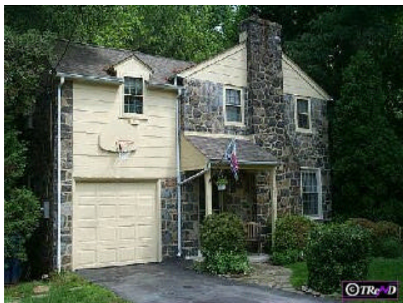
◀ 4 Total Images ▶